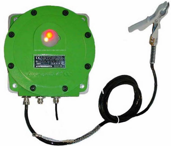
Weight: 15.2 kg