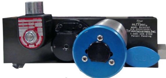
PRECISION CHEMICAL INJECTOR