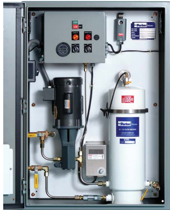
TP3 Series (TP3-MK3 Model Shown)

The TDS5-MK1 unit provides a non-intrusive, cost effective and convenient method of maintaining transformers in a dry condition. In addition, once the transformer is dried, the system can be retrofitted with Activated Alumina cartridges to reduce acidity in the transformer oil. This flexibility allows increased oil processing application compared to heat and vacuum systems.