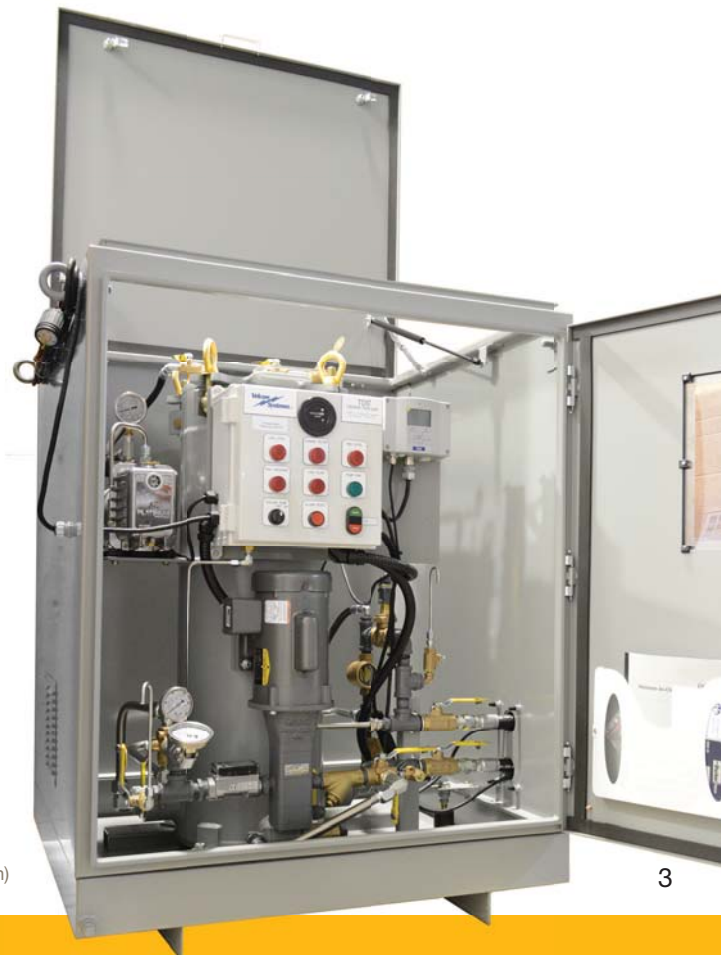
TDS5 Series (TDS5-MK1 Model Shown)

Quality components and comprehensive design features have made the TP3 an industry standard for on-line filtration. All components are fully enclosed in cabinet. Operation of the unit is unattended. A flow rate of 3 gpm keeps turbulence in the reservoir to a minimum and allows for maximum filter life.