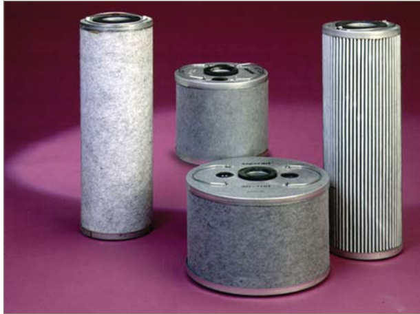
Superdri is a registered Trademark of Parker Hannifin.