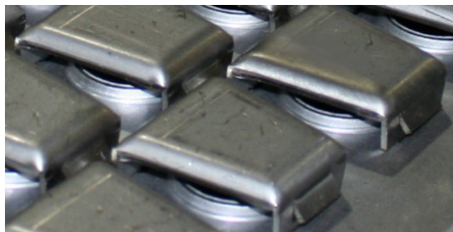
The new FLEXIPRO® valve.

The FLEXIPRO® valve features a specially shaped deck orifice to reduce pressure drop and delay weeping. The redesigned valve cover is also larger than the deck orifice, which leads to reduced entrainment and enhanced sweeping of the deck for superior fouling resistance.